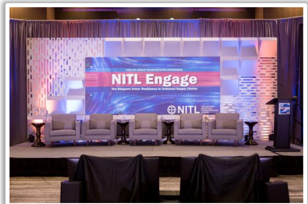
Stage is set and ready to go!