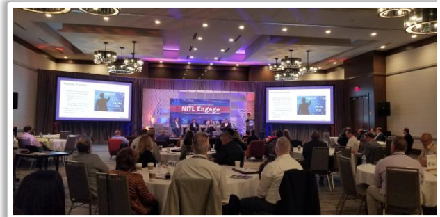
NITL Engage 2023

The meeting room was laid out to accommodate various options. Some of us prefer desks, others round tables, etc. At the front of the room, armchairs and love seats were set up to encourage folks to sit near the stage and several attendees to take advantage of the opportunity. It offered a nice comfortable situation to learn and engage. This setting will be hard to beat in 2024.