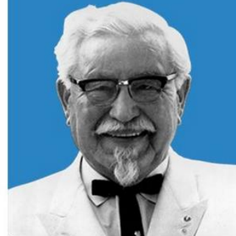
COLONEL HARLAND DAVID SANDERS